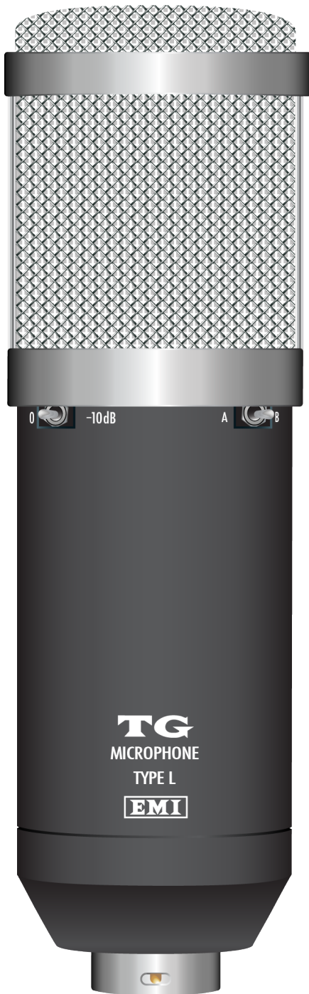
TYPE L REAR ASPECT

The Dual Tone System facility of the TG Microphone Type L is located at the rear of the microphone and below the head basket, and is operable via a toggle switch. The Dual Tone System provides two options, A or B. System A and B modify the input structure of the microphone and have a distinct effect upon how the microphone responds to the source and the character of the sound captured.